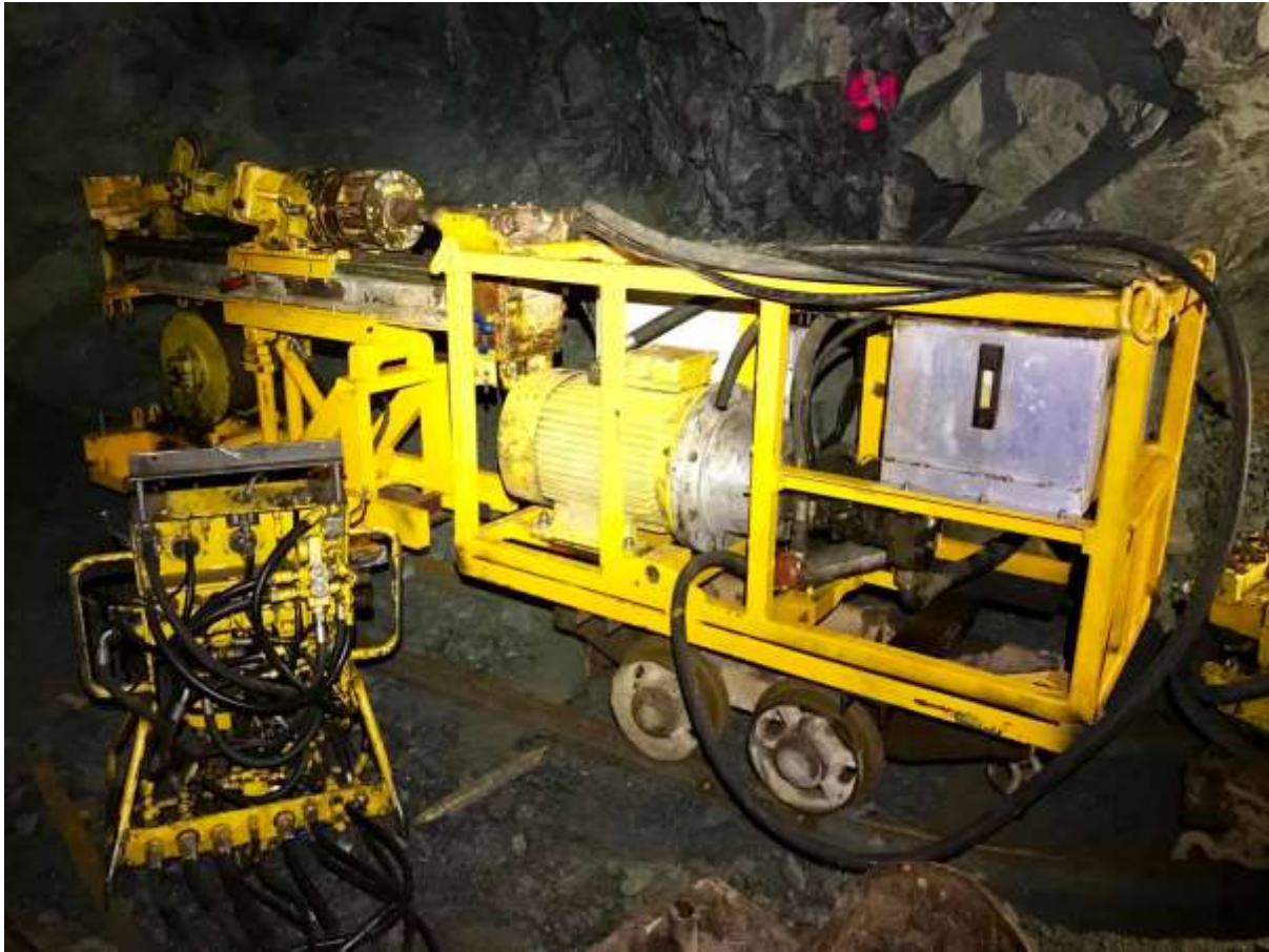
Figure 3: Onram 1000 Underground Diamond Drill Rig