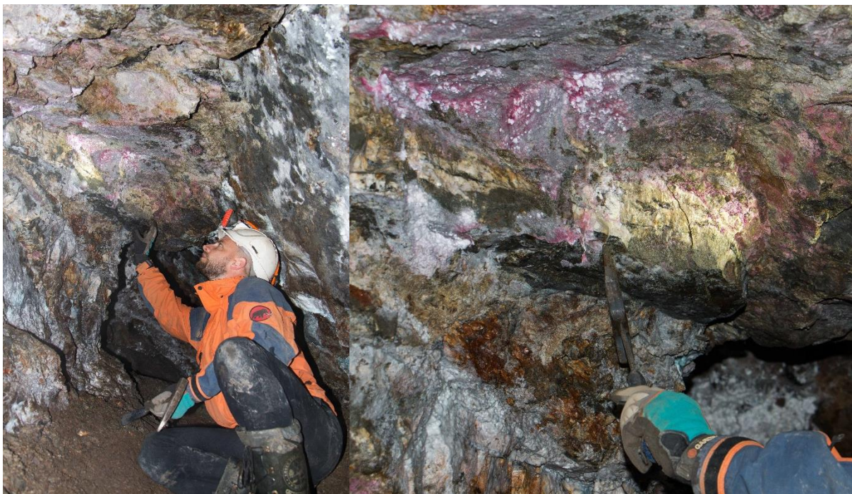
Figure 1: Erythrite (Pink) cobalt mineralisation exposed in Gotthard Adit