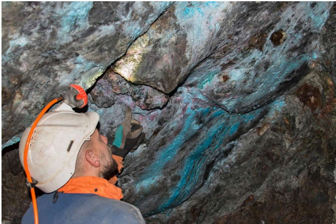
Figure 2: Secondary cobalt (pink, erythrite) and secondary copper mineralisation (green, malachite & blue, azurite)

Historical mining is documented to have occurred over 9 levels spanning a distance of 200m down dip. At present, 3 levels are accessible. Initial mapping of the mineralisation in order to gain an understanding of the geometry and extent of mineralisation has been undertaken. Channel sampling is underway and bulk sampling is planned to be conducted.