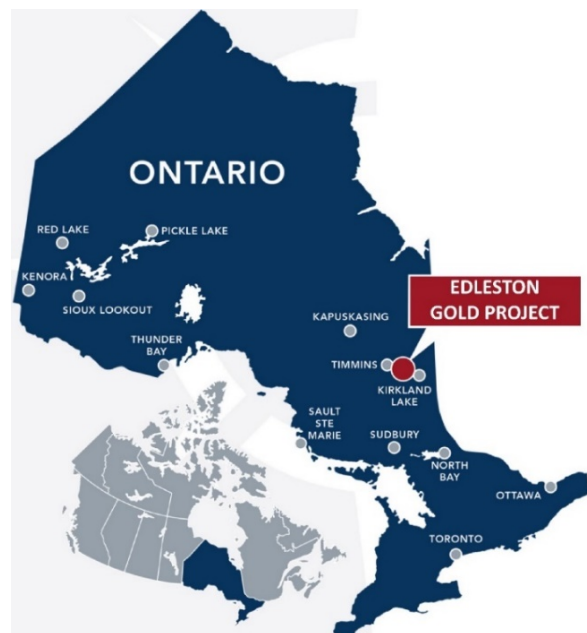
FIGURE 3: REGIONAL LOCATION PLAN OF ONTARIO

Further updates will be provided to market upon completion of this targeting program inclusive of a timeline of activities.”