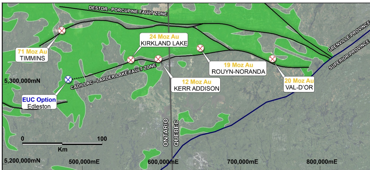
FIGURE 2: REGIONAL PROJECT LOCATION PLAN & PREVIOUS PRODUCTION

European Cobalt Ltd (“EUC” or “the Company”, ASX: EUC) is pleased to announce that it has signed an exclusive option agreement to acquire tenure adjacent to the Edleston Gold Project located in Ontario, Canada. As announced on 1 June 2020, the Company has signed an exclusive 30-day option over the Edleston Gold Project and is currently undertaking its due diligence activities prior to a decision to exercise the option.