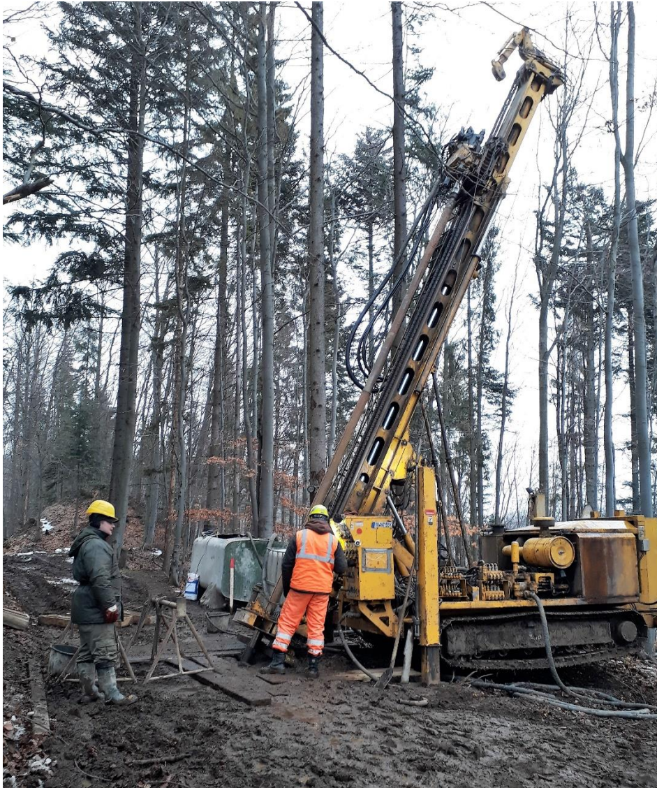
Figure 1: Commencement of Diamond Drilling- Joremeny Target